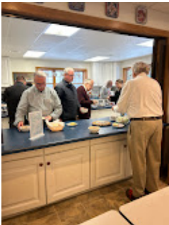
1st 2026 soup & bread 3.JPG 6203K