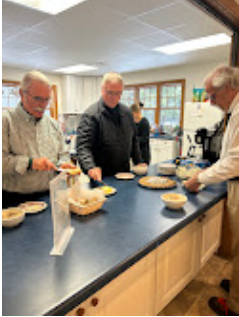
1st 2026 soup & bread.JPG 6560K