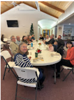
1st soup & bread 2.JPG 7164K